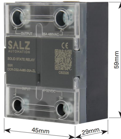
外形图 Outline Dimensions